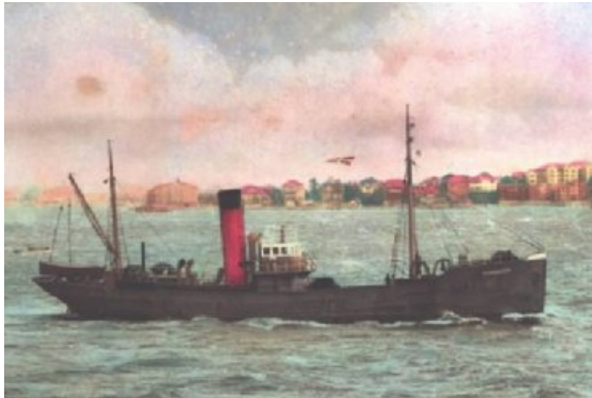
Red Funnel Fishing Trawler Durraween