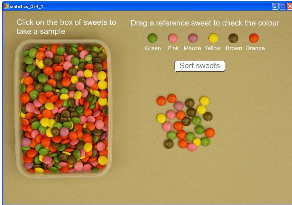
Figure 3. The statistics ISE with a sample of coloured sweets taken. Note that the sample you get is randomly selected, hence you will probably not see this exact image.

A key concept in statistics is that of small samples taken from a much larger population, such that conclusions about the whole population can be reached without investigating it. To take a sample from the population of coloured sweets, simply click on the box, whereby the sample appears as in Figure 3.