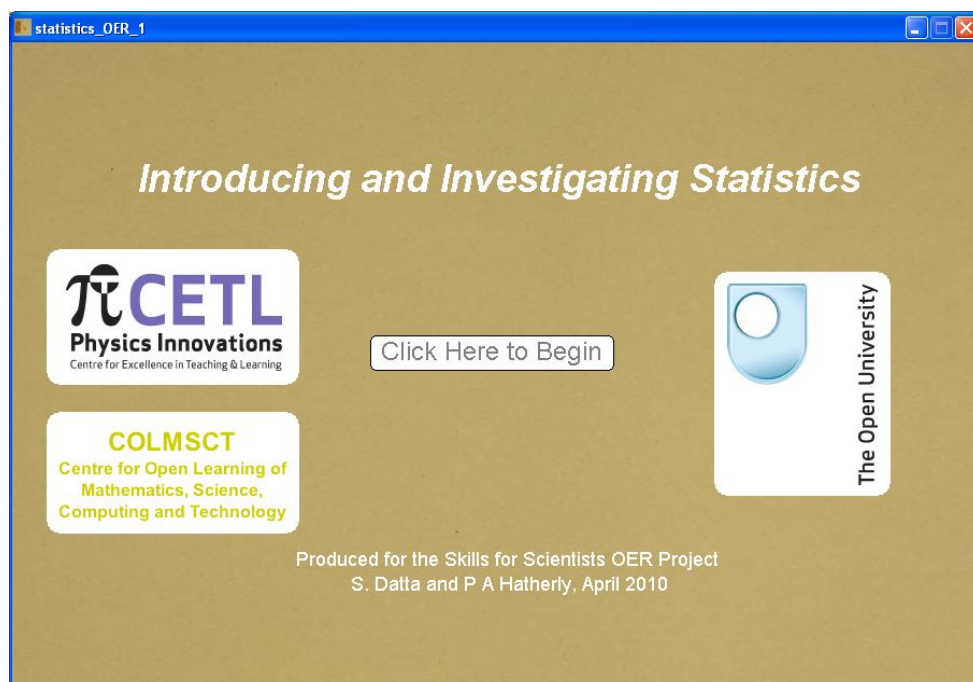
Figure 1. The Vernier scale ISE start-up screen

Clicking the button marked “Click Here to Begin” will take you to the screen shown in Figure 2.